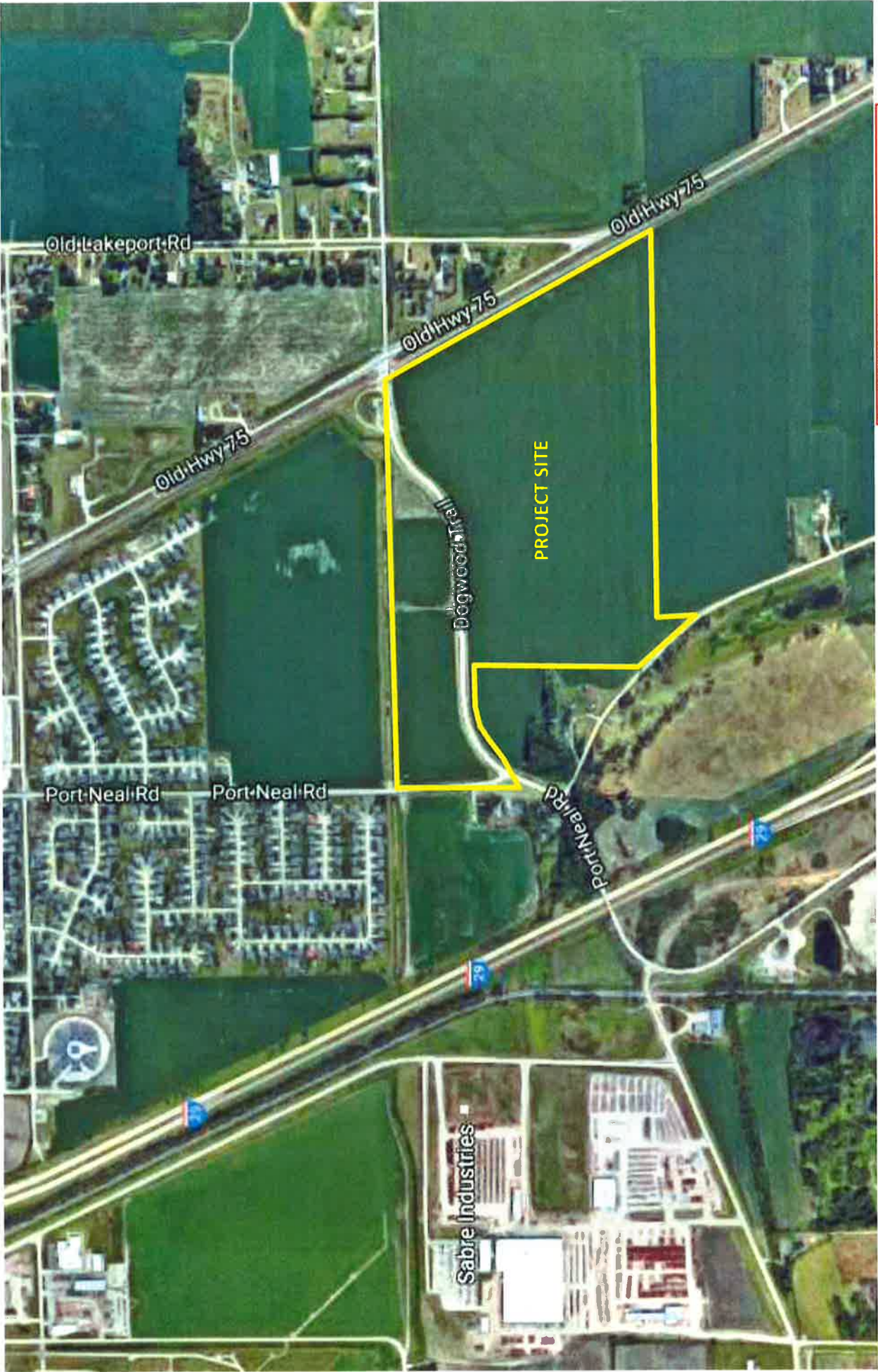
ATTACHMENT 4 - AERIAL PHOTOGRAPH